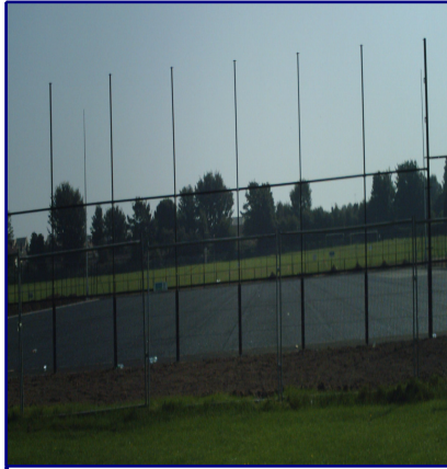
The Astro Turf development taking shape

With funding secured to develop the grass football pitches and cricket facilities, plus possibly the introduction of a rugby pitch and additional changing rooms, it is true to say that Castle will soon-